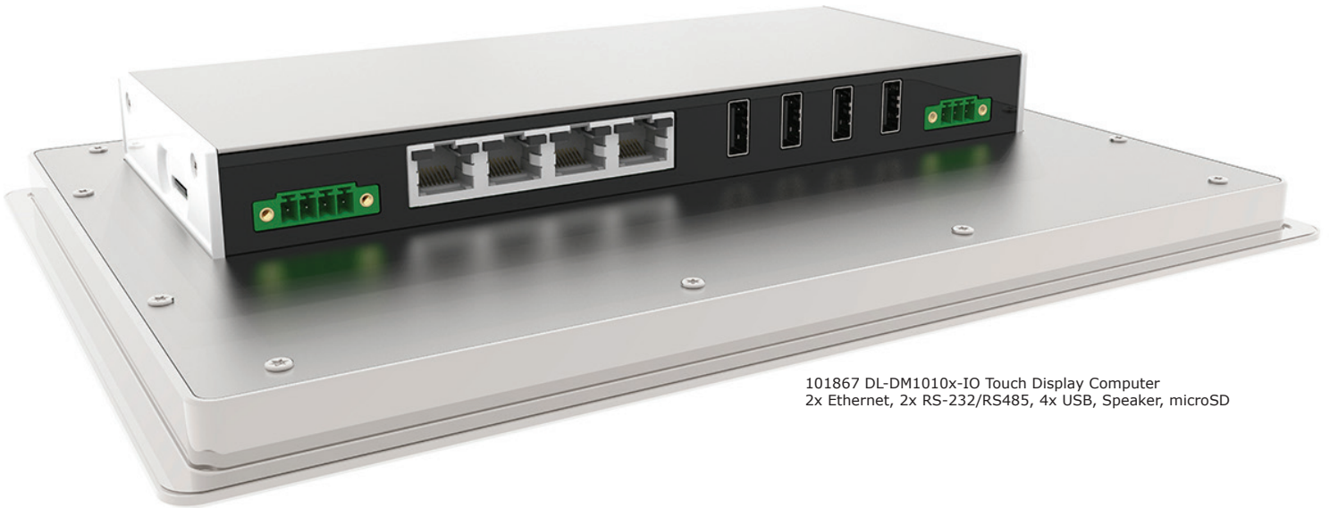
101867 DL-DM1010x-IO Touch Display Computer 2x Ethernet, 2x RS-232/RS485, 4x USB, Speaker, microSD

Our Touch Display Computer hardware and software is optimized for quick adaptation and customization to specific product requirements. To get started we recommend you purchase one of our standard development kits which are available in all sizes and, provide all of the 'out of the box' hardware and software tools required to get your development going within hours, not weeks and months! Our in-house engineering team provides all the support necessary for your team during the entire engineering process.